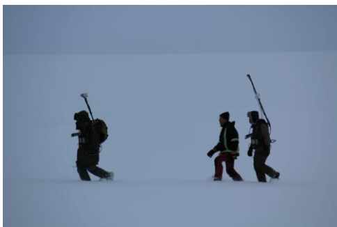
Ground magnetic crews returning to camp.

The next drillhole is planned on target G-13 in the heart of the Darnley Bay Anomaly.